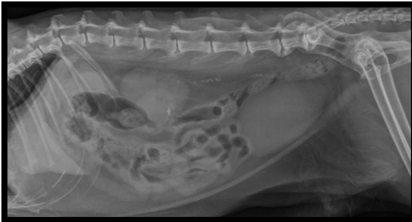
Figure 1. Lateral radiograph of patient. Notice that the left kidney is larger than the right and the multiple stones inside the left ureter ureter and both renal pelvis'.

Uthappa MC. 2005. Retrograde or antegrade double-pigtail stent placement for malignant ureteric obstruction? Clinical Rad 60: 608-612.