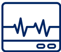
Monitoring Patients Under Anesthesia