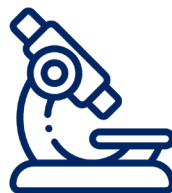
Participating in Clinical Research