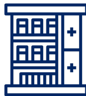
Maintaining Medical Equipment